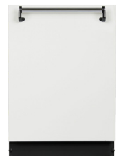
Vintage White ALTTDW-VWT