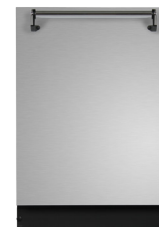
Stainless Steel AELTTDW-SS