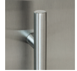
Slim Designer Handle Shown (MP36FA2RS)